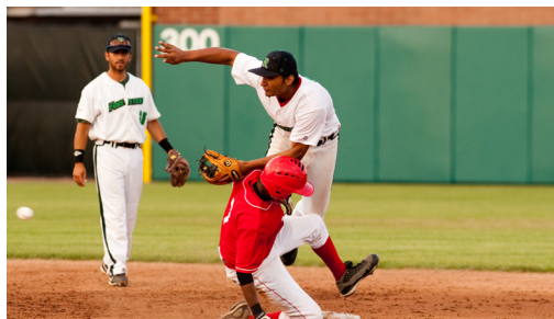
2011 MCL All-Star Game