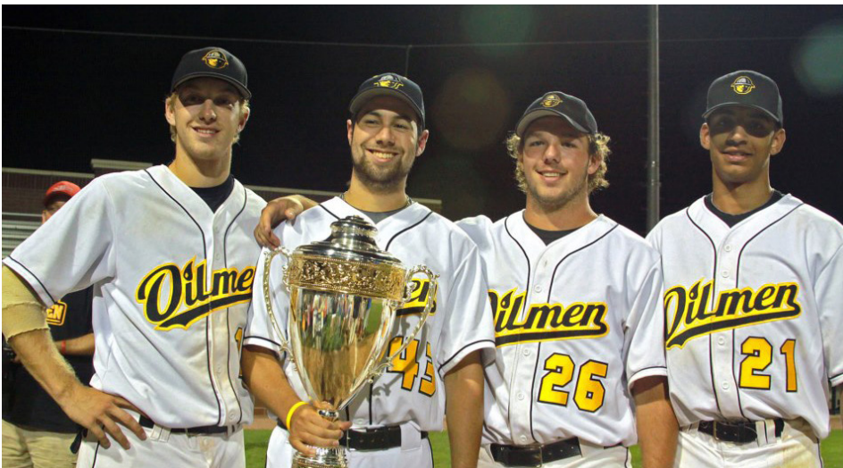
The Oilmen holding the MCL Championship Trophy

As the East and West All-Stars prepare to face-off today, each player will be presented with an opportunity. An opportunity to play the greatest game ever created in a stadium built on an unrivaled history and tradition of hard-work and excellence in Whiting, Indiana. 🍷