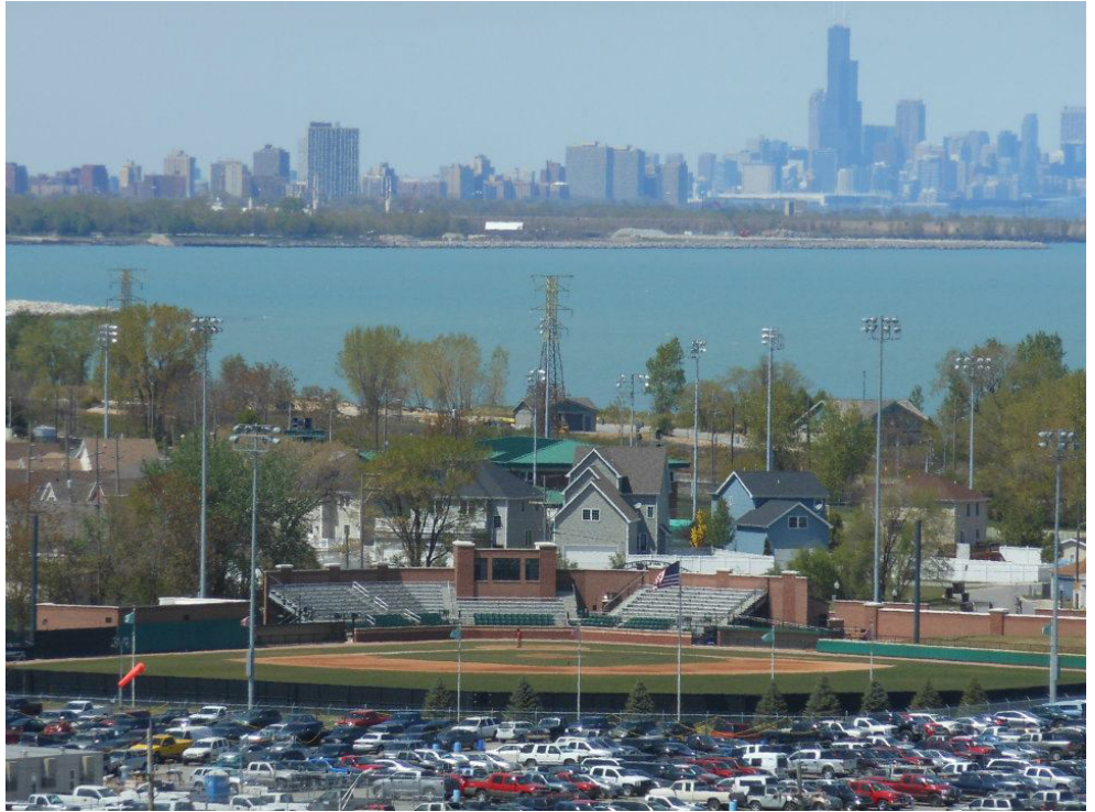
Oil City Stadium with the city of Chicago, Ill. in the background.

In 2012, the newly formed Northwest Indiana Oilmen made it their home and began a legacy of success, securing their first win of the 2012 season at Standards Diamond Park. The Oilmen would win three championships with Oil City Stadium as their home in 2012, 2016, and 2018.